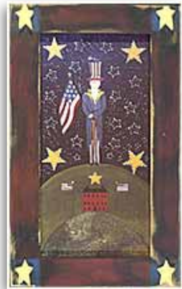
"Liberty Sam" by Barbara Lovendahl

The Lovell Collection was designed as an e-commerce site offering original artworks and fine art prints. The web site design challenge was to create a setting for fine art products in an informational framework of links, using colors which would not interfere with the unique pallet of the artist. Patriotism and the New England countryside theme are subtly included in the design. A carefully selected earth tone color (next pg, top), recedes into the background making the fine art paintings, prints and products the center of attention.