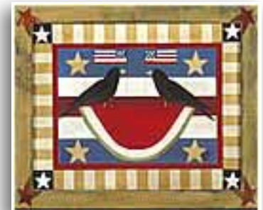
"Liberty Crows" by Barbara Lovendahl

The Lovell Collection logo, both rustic and sophisticated with its fine lines, shows the home-on--hill representative of New England, the inspiration for many of the client's paintings.